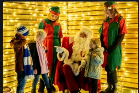
Light Up Festival

Please note that the Museum car park will close once we reach our parking capacity, please arrive early to avoid disappointment. For the safety of our visitors, no vehicles can leave the site while our Lantern Parade is taking place.