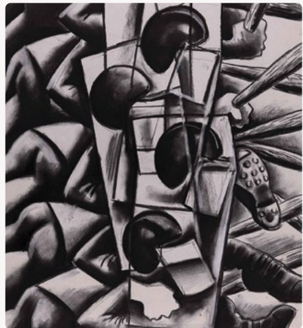
Artwork by George Mallalieu

A display of three charcoal drawings by the artist George Mallalieu, recently acquired by the Museum. On the theme of the Miners' Strike, these preparatory drawings were for a large diptych, a double painting, entitled 'The Miners' Strike, 1984-85'. The finished painting is presumed lost in a fire at the artist's studio in 2000.