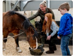
Pony Discovery Centre