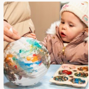
Family Lantern Making Workshop

Discover the fascinating role of cats in the coal mines and learn needle felting techniques to craft your own charming colliery cat.